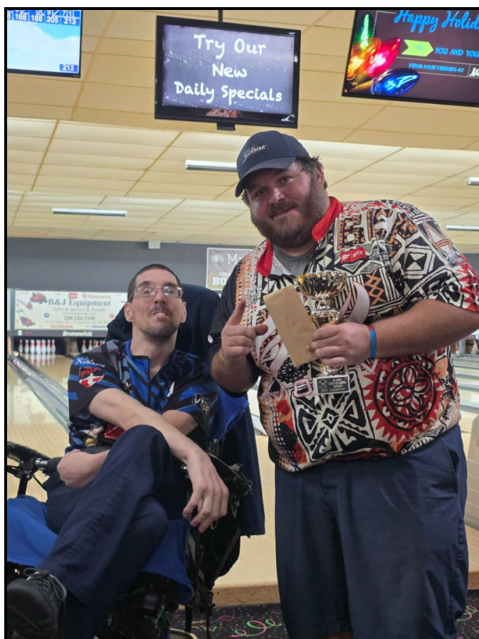
Pictured at Left